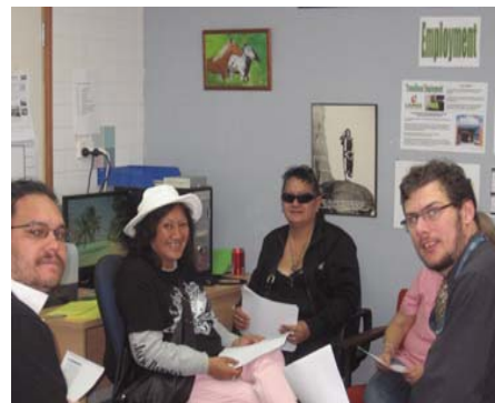
Members and management committee Member working in the Employment & Education Unit

Canefields is a restorative environment for people who have had their lives drastically disrupted, and need the support of others who believe that recovery from a mental illness is not a myth but is possible for all.