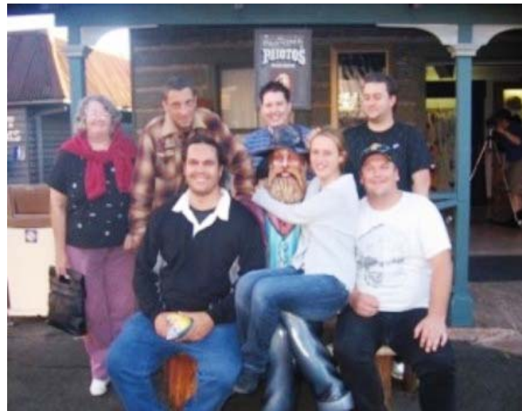
Group shot at Dream World 2009