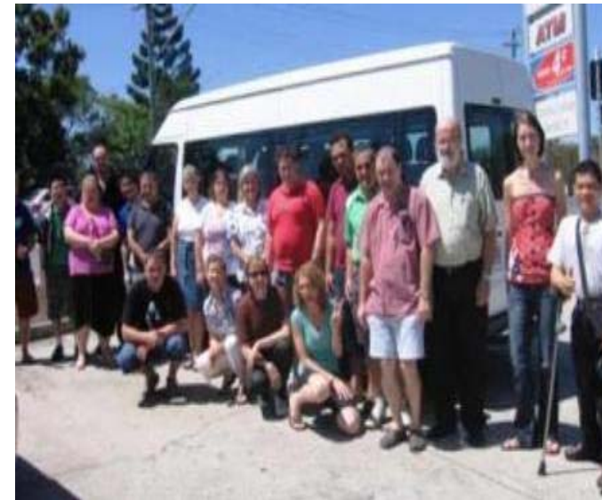
Training Base visit 2009