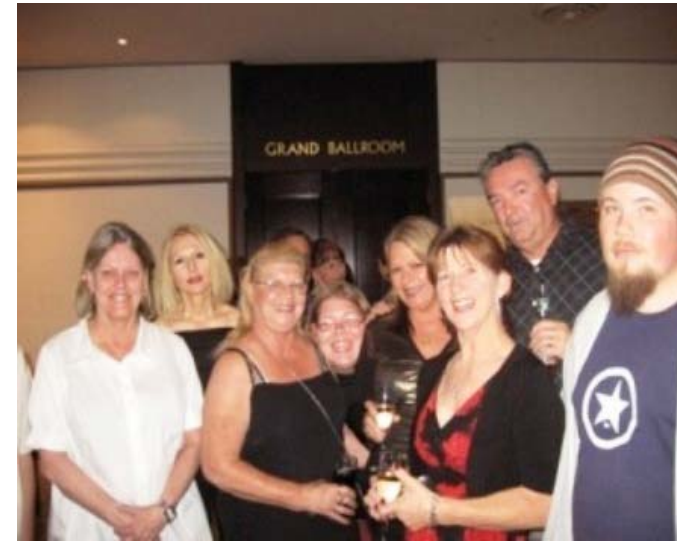
Australasian Conference Sydney 2008