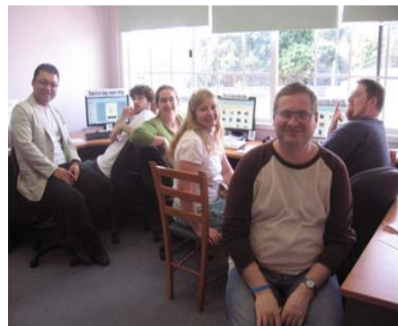
Members working in Mega Space